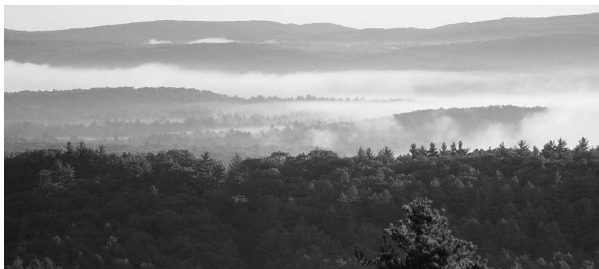
TAKEN FROM THE NEW SALEM OVERLOOK

C O N S E R V I N G T H E L O C A L L A N D S C A P E ™