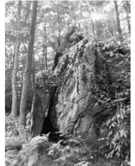
A dramatic outcropping located on the land of the conservation buyer adjacent to the project.

ties about this land. In their generosity, they are willing to purchase the property, protected by a Conservation Restriction, while covering what Mount Grace paid for it, plus costs. It is this commitment to protect and steward land, even though it is no longer "developable," that may drive conservation work in times of tight public funding. The funding provided by these conservation buyers will allow Mount Grace to spend energy and resources on other projects. The process of land protection continues, one project at a time. Conservation buyers make land conservation work. ■