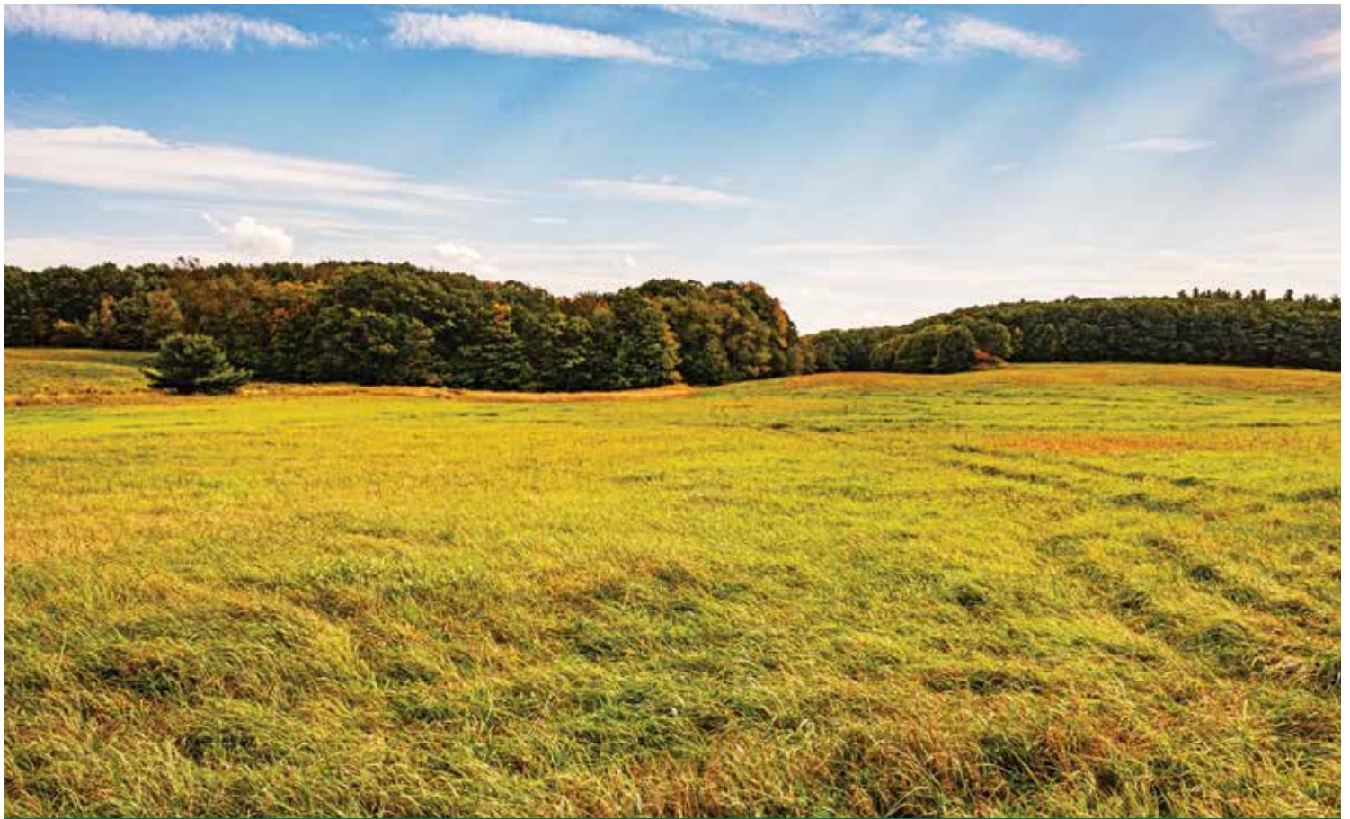
The Norcross Hill Wildlife Management Area in Templeton.

Mount Grace's Landscape Conservation Program is the guardian of a rich mosaic of natural lands. We act quickly and strategically to safeguard our rural heritage and bolster our region's legacy of land conservation. Working with partners, we save the landscapes that our natural and human communities need to thrive. Together, we stitch these ecologically significant and locally important places into one connected and resilient landscape.