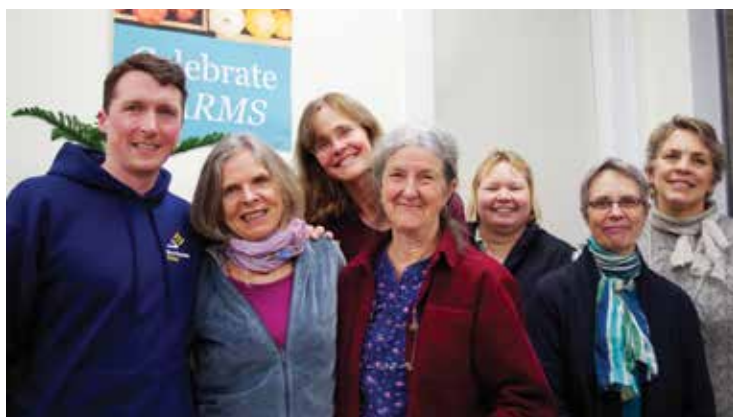
The Quabbin Harvest Flip the Switch party celebrated the installation of solar panels on the roof of Mount Grace's downtown Orange building. The panels will provide 17,000 kWh of power this year for the co-op.