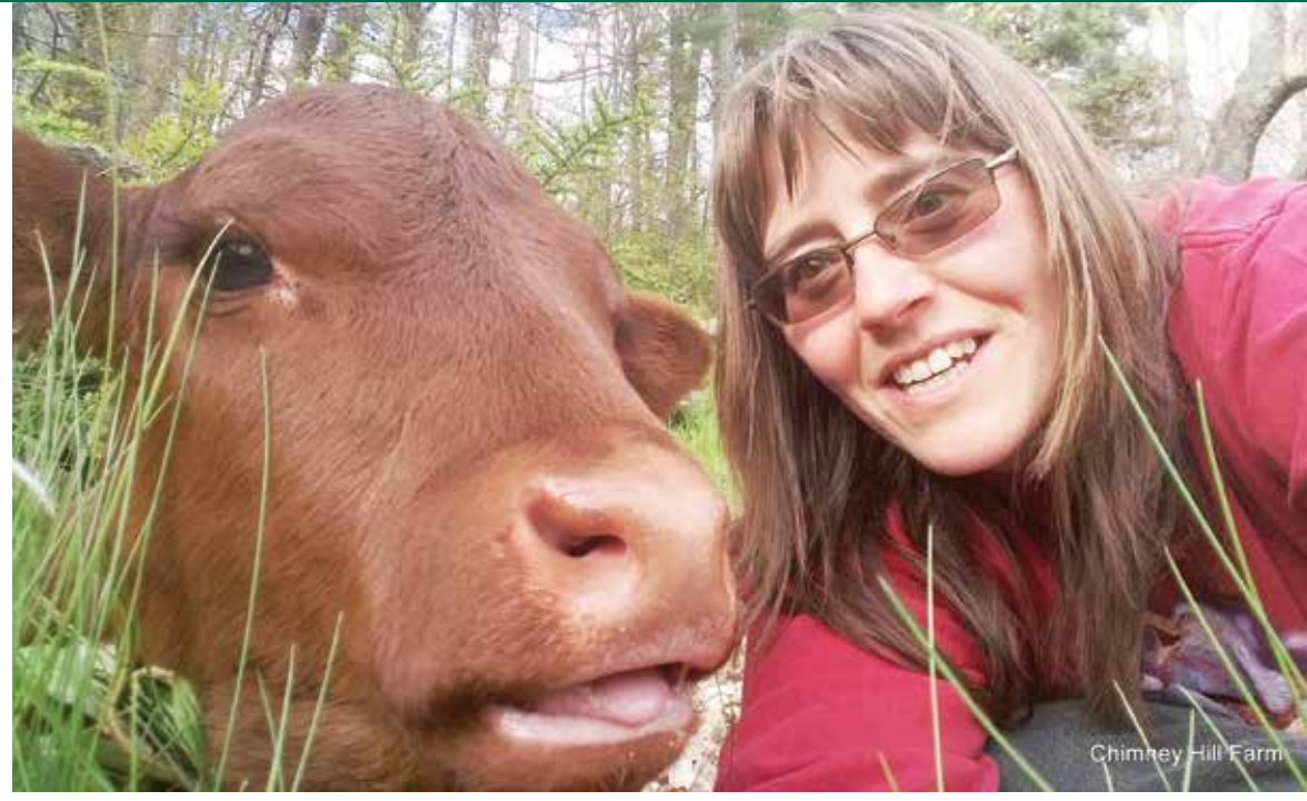
Join us on October 20th at the Annual Meeting to meet the people and animals at Chimney Hill Farm, one of the partners in our Quabbin to Wachusett Initiative.