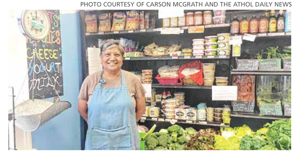
Stop by Quabbin Harvest (at 12 North Main Street in Orange) for the latest twist on local food from Nalini's Kitchen.

Middle Eastern, and Mediterranean inspired mixes.