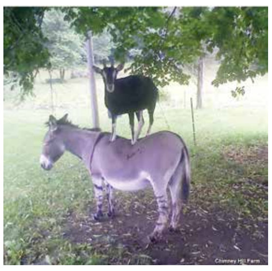
Partnership make anything possible!