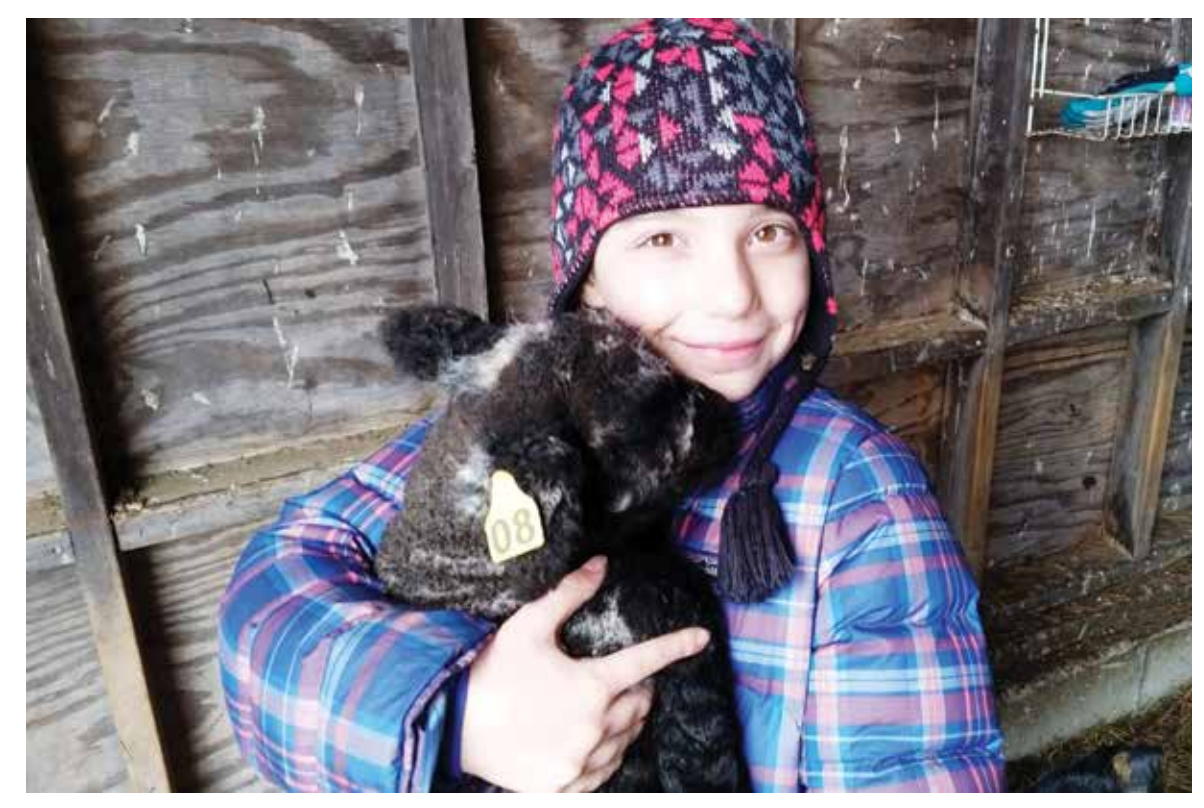
The Richardsons host students from the Village School at their farm every spring for lambing.