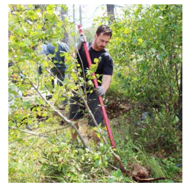
Fletcher goes mano a mano with some glossy buckthorn

I'm happy to report that we received a $15,000 grant and are now preparing for our projects this spring. The work at Eagle Reserve will remove glossy buckthorn which is displacing native vegetation on the wetland edge where birds forage and nest.