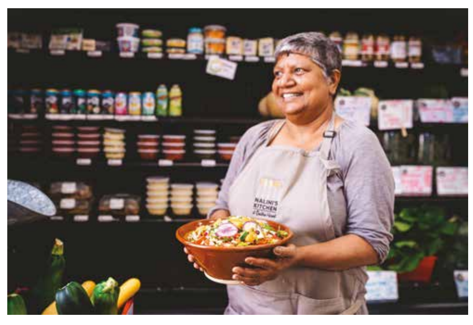
Good food from Nalini's Kitchen is just one of the reasons we value Quabbin Harvest.

Area farms and food businesses, many of them very small businesses like ourselves, would lose an outlet for their products—more than $150,000 worth in the past year.