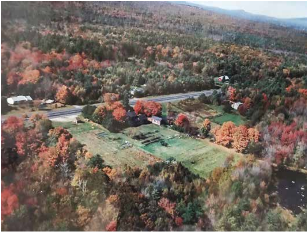
An aerial photo of Sunset View Farm.

of raising funds for an Option to Purchase at Agricultural Value. This tool ensures the land and its buildings are sold to farmers at an agricultural value. The goal is to keep the land affordable and in the hands of farmers—forever.