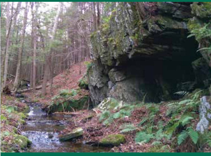
Hodge Brook is just one of the many cold-water streams that will be protected with the completion of this project.

Gifts also came in from families and individuals around Massachusetts, underlining the impact of Gales Brook, which will conserve open lands and riparian habitat along five separate