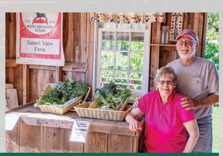
Locally grown fruits and vegetables are sold in the colorful roadside farmstand throughout the growing season.