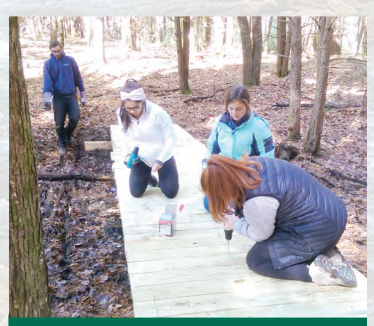
Umass Amherst students helping the Stewardship team build a bridge as part of a Civic Engagement course.

materials. Thanks to their enterprising efforts we finished within two days. Come enjoy our new bridge and dry boots by visiting the property on Tully Road, next to Noel's Nursey in Orange.