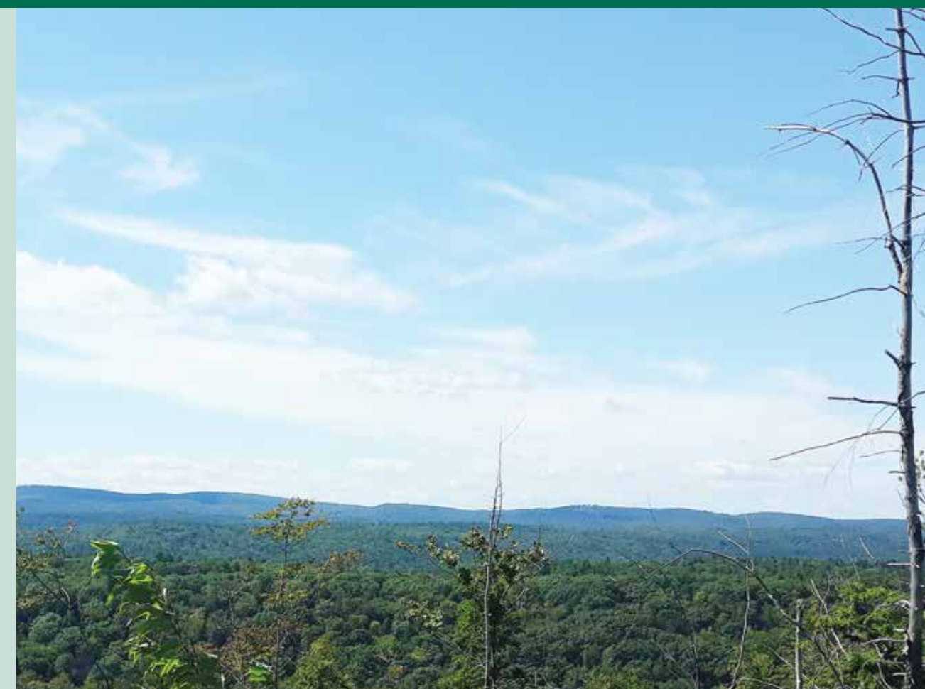
The view from the Littlewood Property—the newest addition to the Warwick Town forest and the first project completed as part of the Greater Gales Brook Conservation Project.