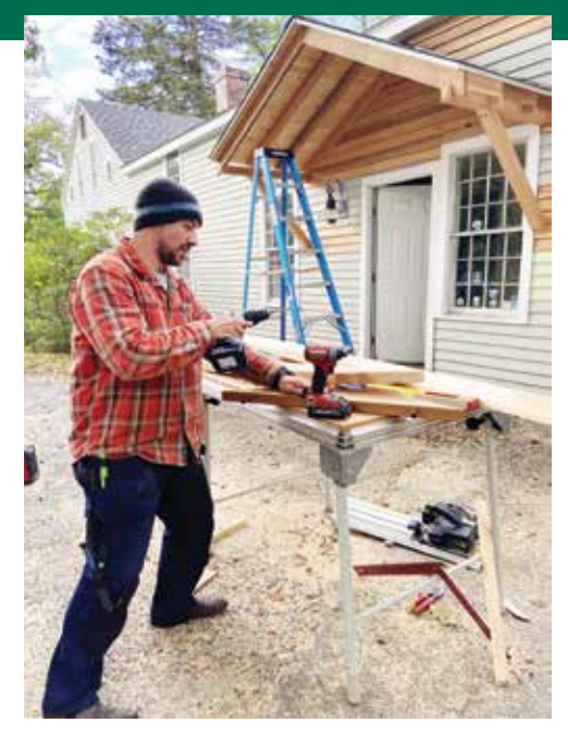
Local craftsmen have now completed the new entryway at Mount Grace's headquarters, Skyfields Arboretum.

These renovations are making a huge difference for our 15-person team bouncing around in this small, repurposed farmhouse. In the coming months, we will be gearing up to break ground on our new timber-frame barn workspace that will be